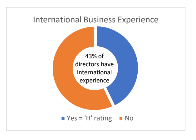
Diagrams 3 - 6